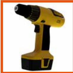
Battery Drill (NOT impactor)