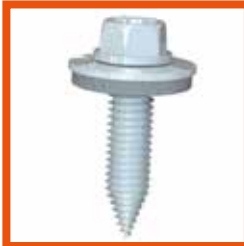
Self Drilling Screw