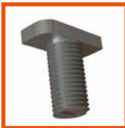
M10 T Bolt