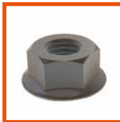
M10 Serrated Nut